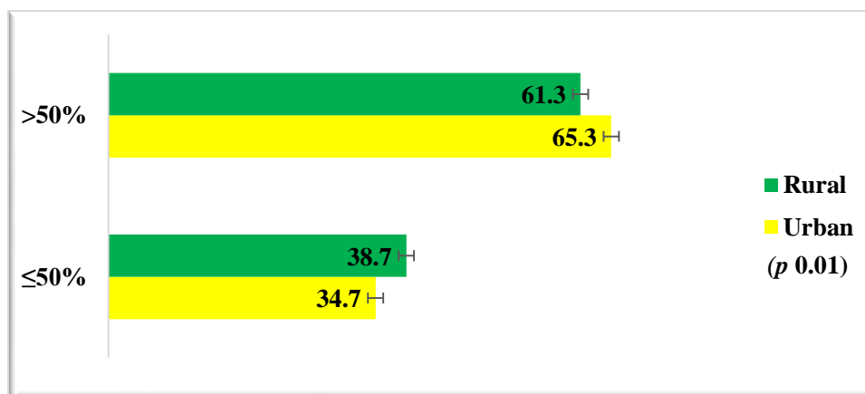
Figure 1. Knowledge level on rabies among respondent by residence

level. In rural area, 61.3 had more than 50% knowledge level and 38.7% had had 50% and less level respectively. By comparing by residence, there is significant difference between urban and rural areas ( p < 0.01 ).